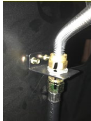
Not recalled — fuel line mounted inside grill

If your grill has a fuel gauge attached to the regulator hose and the fuel line is not attached to the side of the grill stop using the grill and contact the MR. STEAK recall hotline to receive a free repair kit.