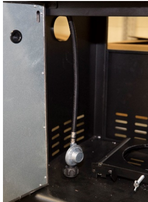
Not recalled — no gauge attached to regulator assembly